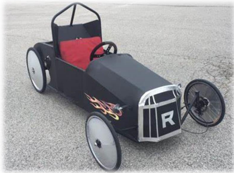
Ranken sponsored Missouri SuperMileage Challenge

Ranken provides more hands-on training than anyone. A Ranken education will help you launch the career you have been dreaming of. Stop dreaming and speak with an Admissions Counselor today, for a brighter future tomorrow.