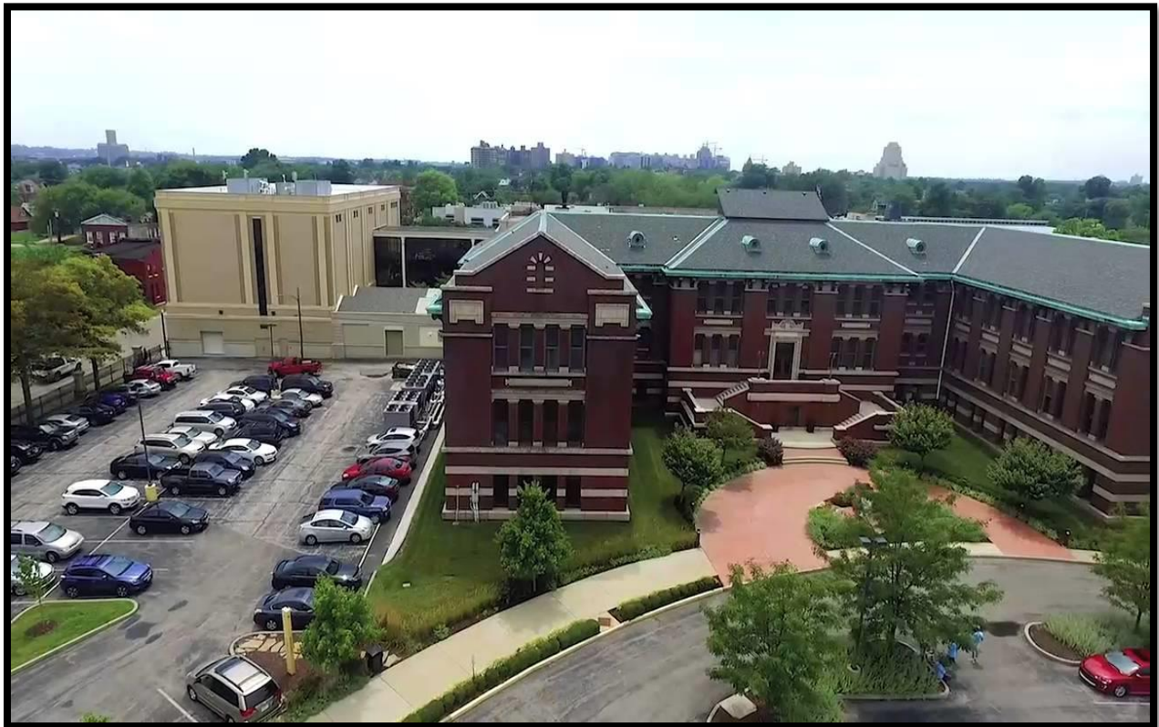
RANKEN TECHNICAL COLLEGE OVERHEAD VIEW

To request a paper copy of the Annual Campus Crime Statistics Report, contact the Director of Public Safety by calling (314) 286-3300 or by emailing cmdennis@ranken.edu .