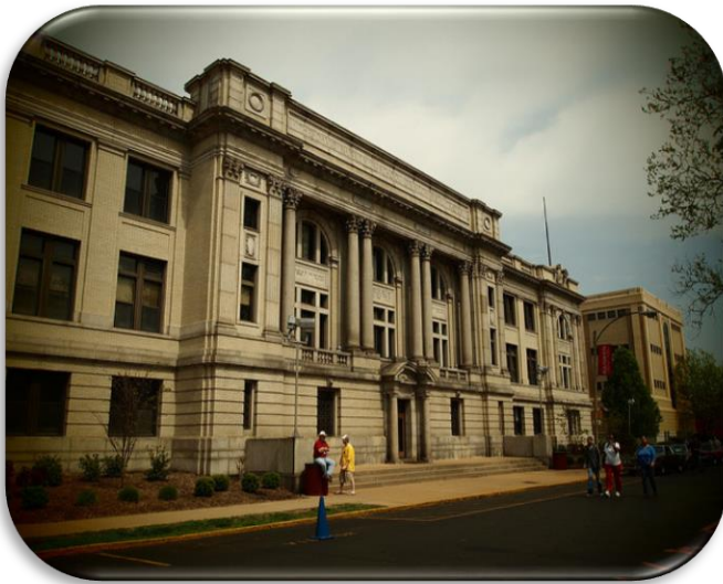
The Starting Point