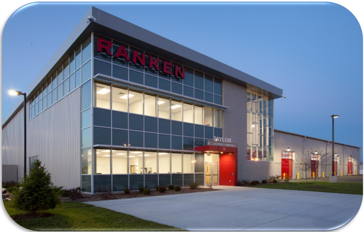
Wentzville Taylor Building

Courses are offered during the day and evening, with degree and certificate options available. For more information on our Wentzville location, contact us at (855) RANKENW, or visit us online at www.ranken.edu/Wentzville .