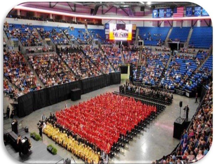
The Epitome of Success