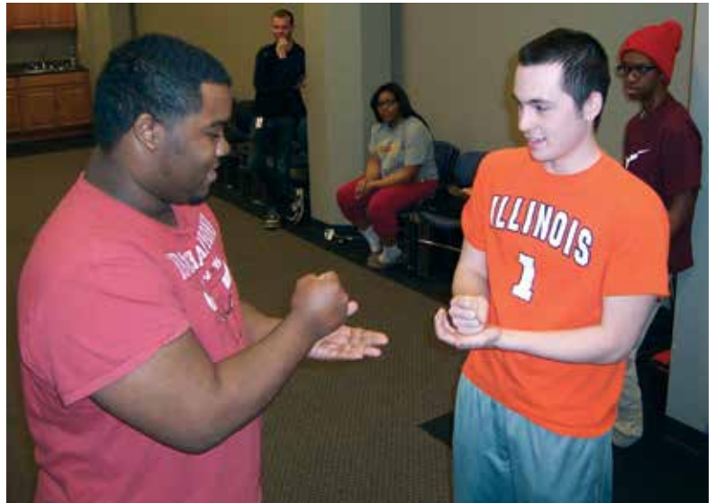
Above: Residents participate in a Rock, Paper, Scissors tournament