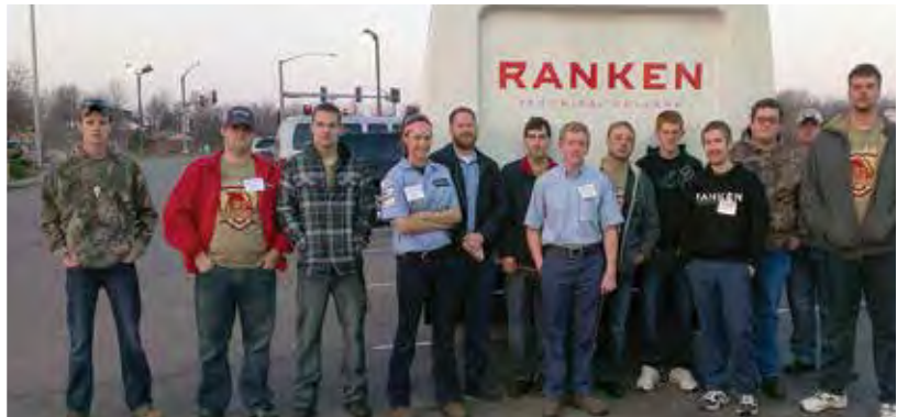
SkillsUSA competitors gather for a group photo

for completion of this phase of the Rodenheiser building is one week before fall classes begin on August 27.