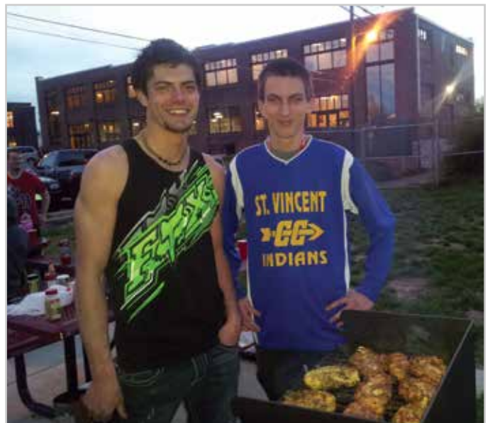
Right: Residents gather around the grill to enjoy BBQ night