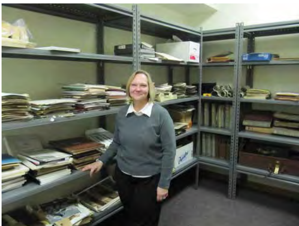
The Ranken Archives