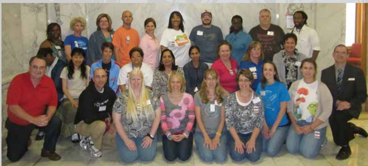
Summer STEM Academies for Educators participants

From June 24-30, upcoming high school seniors from the local College Summit program will visit Ranken's campus. During their stay, students will be staying in Walker Hall and attending various sessions which give them the tools they need to begin the college application process. College Summit's mission is to increase the college enrollment rates of youth from low-income communities, serving more than 50,000 students across 12 states. For more information, visit http://www.collegesummit.org .