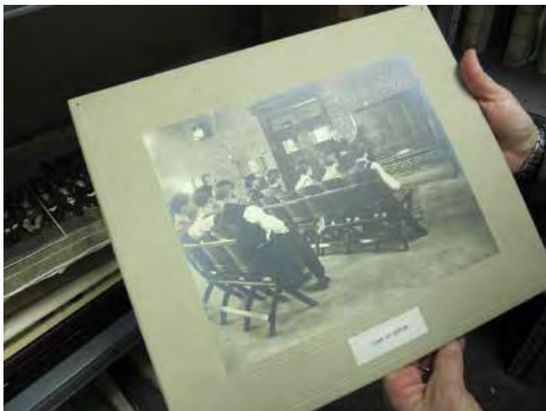
Preserved photo in Ranken's archives

Once the images are processed, stored properly and finding aids created, Ranken hopes to host a special evening, open to local historians and other scholars, to reveal the images and documents in the archives. The material, including this incredible photograph collection, should lead scholars and their students (including those at Ranken) to undertake or add to their research on many topics at various levels. Additionally, the archives plan to use its material, in particular the photographs, to create various displays and exhibits on campus and in the community to promote knowledge about and interest in the history of the institution, its role in