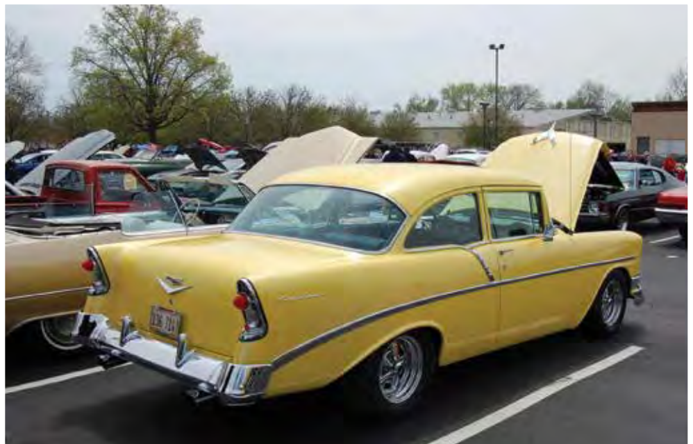
One of the many dream cars in attendance at Ranken's 10th Annual Car Show