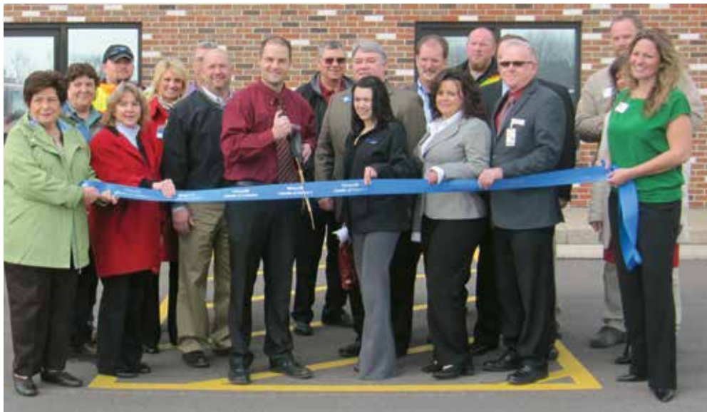
The Wentzville Chamber of Commerce hosted a ribbon-cutting ceremony to celebrate the grand opening of Ranken Wentzville