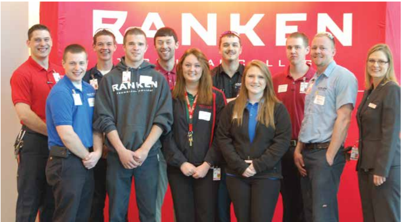
S-STEM scholarship recipients pose with their faculty liaisons.

Overall, the home received a Home Energy Rating System (HERS®) Index rating of 51 on a scale from 140 (least efficient) to 40 (most efficient), with 100 being the typical rating for new homes. The home, which has already been sold, will save its owner an estimated total of $1,005 per year on energy costs.